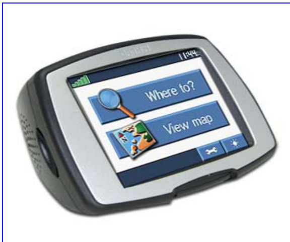
Garmin Street Pilot c330 GPS Navigator

Raffle tickets for the GPS are $5.00 each or 5 for $20.00. Tickets will be available to purchase at the booth in Lexington. If you are not attending the Convention and would like to purchase tickets email me at Linda.smith@ky.nacdnet.net .