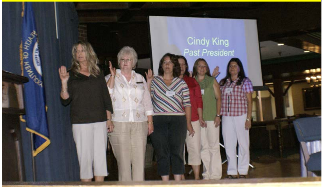
Installation of 2007 KACDE Officers

KACDE is busy getting prepared for this year's business luncheon in Lexington at the KACD Convention.